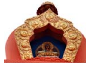
Sedona Amitabha Stupa & Peace Park